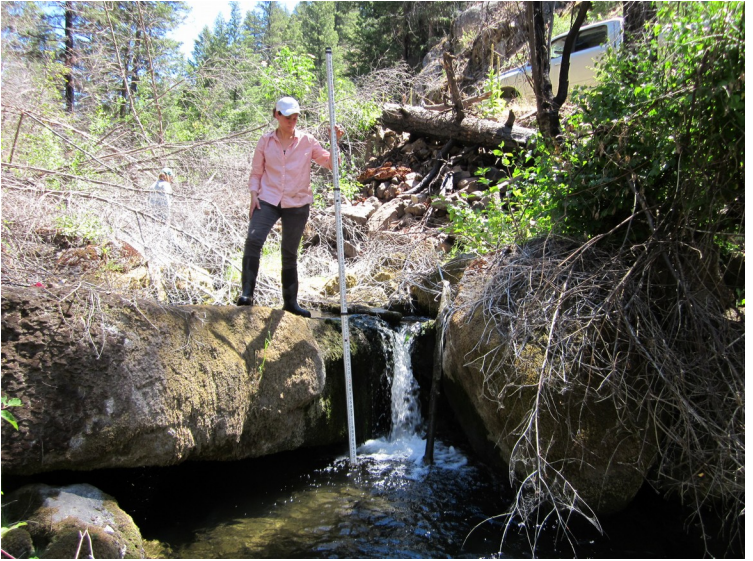
Falls on Deer Cr that is a juvenile barrier only