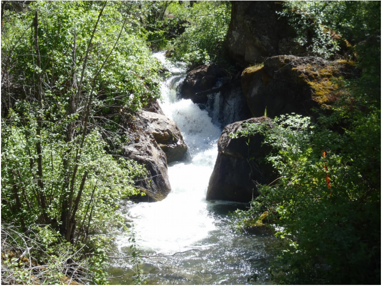
Looking upstream showing the lower two falls