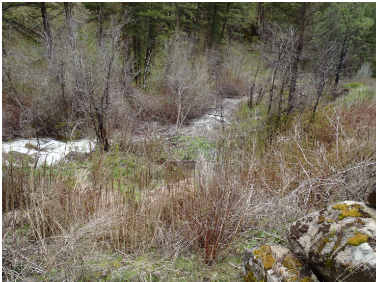
Deer Creek lower Falls during high water