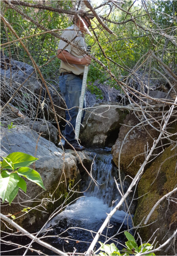
Upper most barrier (4th barrier)