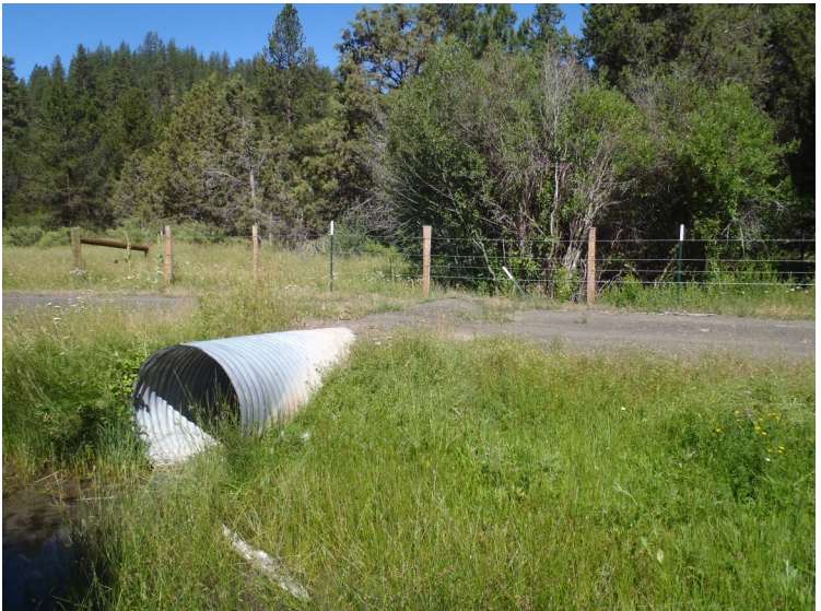
Culvert Inlet and road bed showing bump