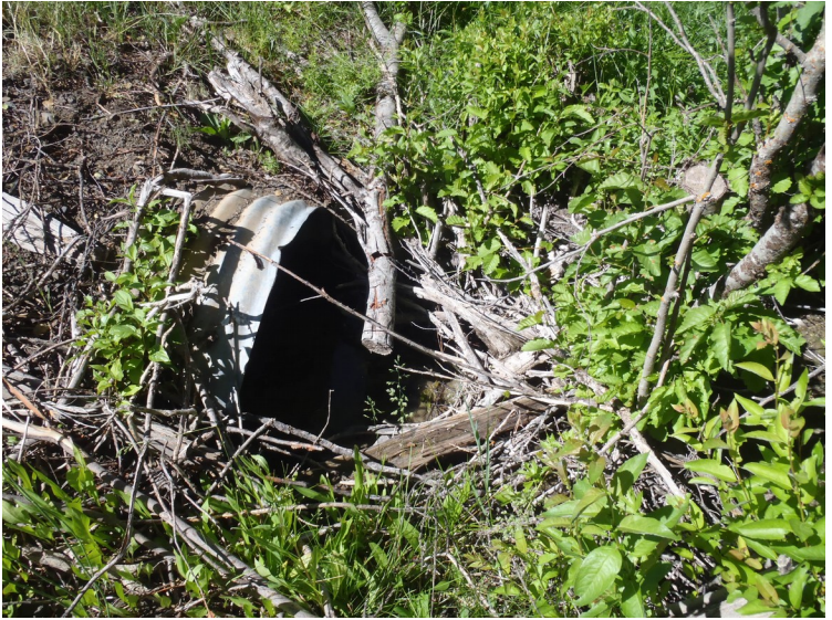
Lemon Cr culvert # 1 outlet plugged with debris